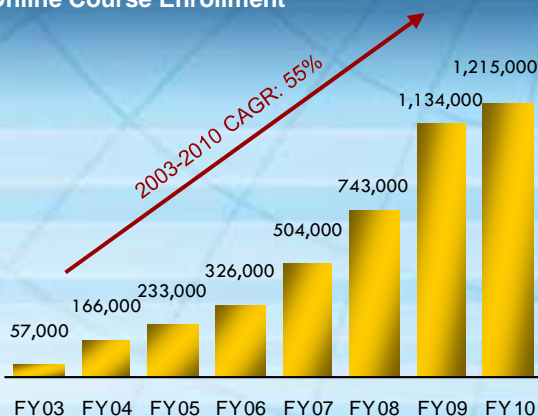
Online Course Enrollment